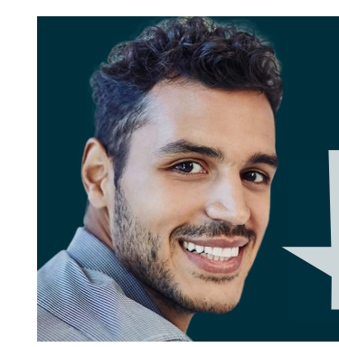
Can I do the Speaking test with another student from my class?

Ask your exam centre because different exam centres have different rules. But there's no evidence that candidates perform better or worse in the Speaking test if they know their partner. Some people might feel more relaxed and confident, but other candidates may find this situation difficult or unnatural.