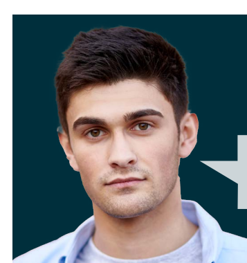
How important is spelling?

At advanced levels, accurate spelling is very important. In the Listening paper of the C2 Proficiency exam, you must not make any spelling mistakes.