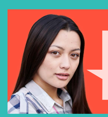
Will I get one or two scores for the Reading and Use of English paper?

Two. Your Reading score is based on Parts 1, 5, 6, 7 and 8, and your Use of English score is based on Parts 2, 3 and 4. Your Statement of Results will show both scores, plus three more: one score for Writing, one for Listening and one for Speaking. Each of these five scores is equally important when calculating your overall score.