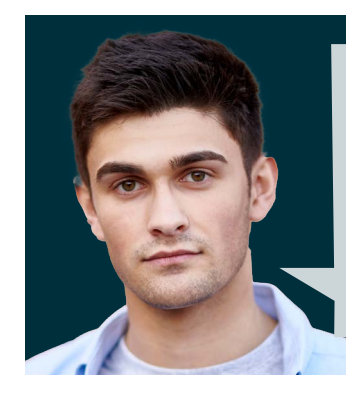
What if my partner for the Speaking test is better than me at speaking skills, or won't let me speak?

Examiners are specially trained for situations where one candidate is stronger or weaker, or if one person talks too much or not enough. Don't worry – they will make sure you get a fair opportunity to show your speaking skills in the test.