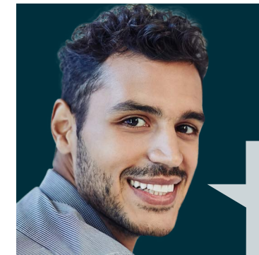
What if I write too much, or if I don't write enough?

The instructions indicate how much you should write. If you write a much shorter answer, this could mean the task has not been successfully completed. For example, if the conclusion is missing because you ran out of time, this could affect the organisation and coherence, and could therefore be penalised. And if you write too much, this could indicate irrelevance, repetition or poor organisation. You won't necessarily lose marks for writing slightly more or less than the length indicated in the question – just take care to answer the task completely and clearly.