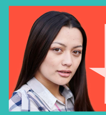
How are the C1 Advanced and C2 Proficiency writing tasks different? They seem quite similar ...

C2 Proficiency writing questions are designed to generate language that requires you to use more abstract functions such as hypothesising, interpreting and evaluating, and to move away from simply fact-based responses. This raises the level of language you are expected to demonstrate – not only in terms of structure, but also range of vocabulary and appropriateness of style and register.