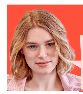
Can I choose who my Speaking examiners will be?

No. The exam centre decides which candidates will be assessed by which examiners. Examiners are specially recruited and trained to assess impartially and to the same standard, so it doesn't matter which examiner you have. Also, examiners are never allowed to assess their own students or anybody they know socially. And remember: there are always two examiners, both of whom make an assessment.