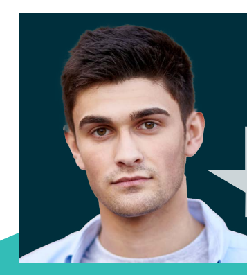
Will I lose marks for incorrect answers?

No. A correct answer gets 1 or 2 marks, an incorrect answer gets 0 marks and no answer gets 0 marks. So if you're not sure about an answer, it is best to guess something! Remember, though, your spelling must be accurate in all parts of the test. (American spelling is OK – but don't mix American and British. It's important to be consistent and use only one variety.)