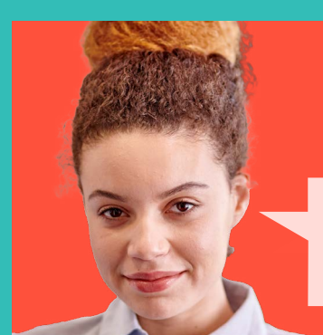
Can I plan and make notes?

Yes, you will be given paper that you can use to plan and make notes for the Writing test. If you need more paper, raise your hand. Remember to leave all the paper in the exam room after the exam has finished.