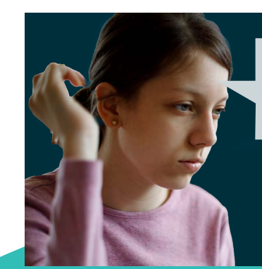
Will I lose marks for incorrect answers?

No. A correct answer gets 1 mark, an incorrect answer gets 0 marks and no answer gets 0 marks. So if you're not sure about an answer, it is best to guess something!