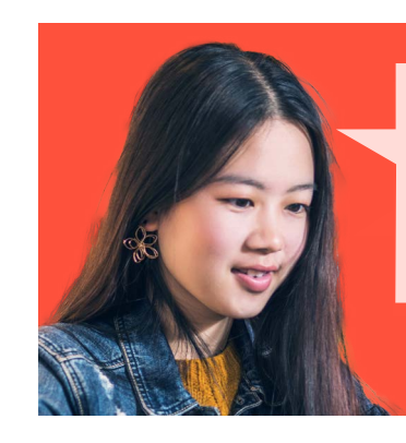
What if I don't understand all the words in a reading text?

Just continue reading and try to understand as much as possible. Use the context to help you. In the exam, you can't ask what a word means nor use a dictionary, so it's important to be able to read without stopping to look up all the words.