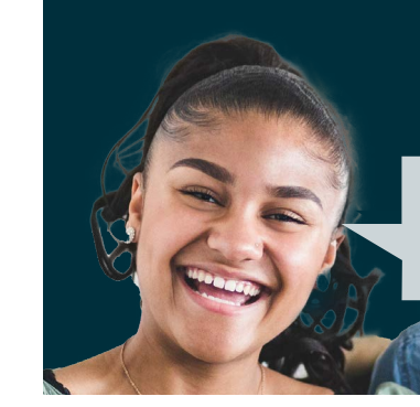
How many times will I hear each recording?