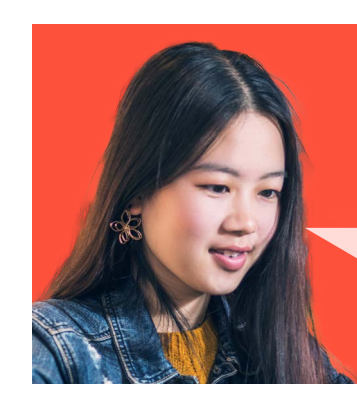
Can I pause the recording?

No, you cannot pause the recording during the Listening test.