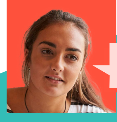
How important is spelling in Part 2?

It's OK to make some small spelling mistakes in the Listening paper of this exam, but it must be clear what you were trying to write. If the word is very common (for example, Monday ) or if the recording gives a word letter by letter (for example, a person's name), then you must spell this correctly.