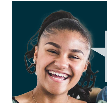
In the digital exam, can I see all the text and questions at the same time?

You might have to scroll up and down to read the whole text and see all the questions in the digital exam paper.