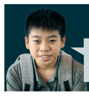
I have hearing difficulties. Could I lose marks because of this?

No. You or your teacher must contact your Cambridge test centre to make special arrangements.